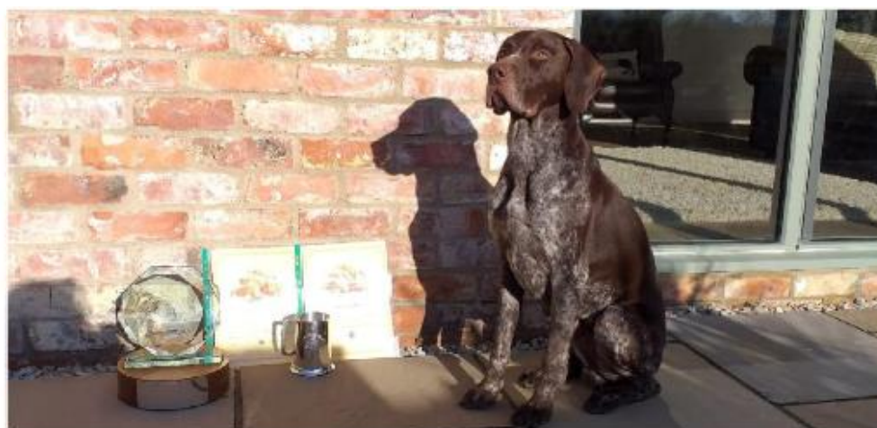
Goosepoint Gloster Grebe