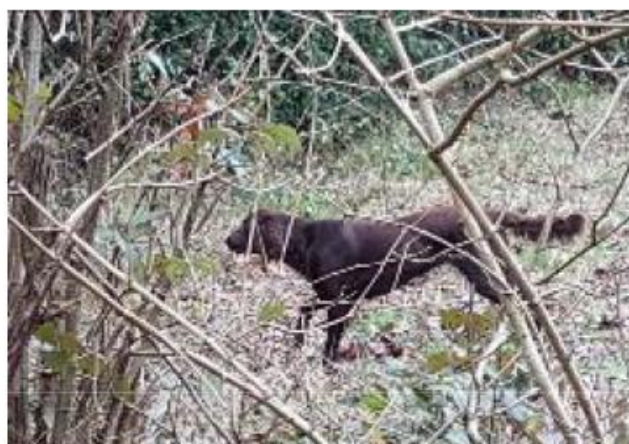
Questor Layla at Cadanbyrig - 1st AA

Congratulations to the Questor 'L' litter, with three dogs in these awards