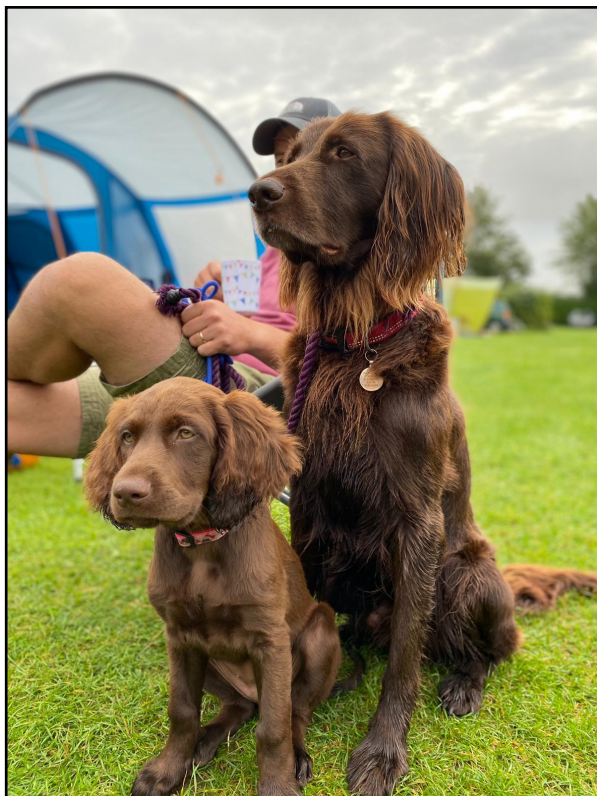
Caper has found his vocation babysitting little sister Fergie recently arrived from Ireland