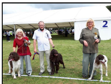
GLPs at Bath Championship Show