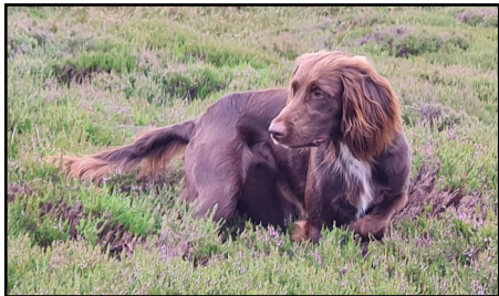
Rizzo learning to point grouse

secured a venue and date for a Club show to be held in 2022. This will be the first Club show since 2015 so get the date, 28th May, in your diary and be there to support your wonderful breed.