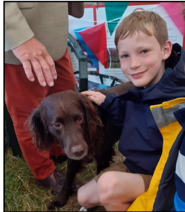
Showing what an amazing all rounder the GLPs are

In Ireland one of our members has had a litter of GLP pups, a couple of which will be coming to the UK, which is great news for the future of the breed.