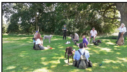
Relaxing in the shade

We will be planning more of these days in 2022 and would suggest if anyone is interested they should either contact Coshy Kimberley at ftsec@glpc.org.uk or follow the GLPC on Facebook as that is where they will be advertised initially.