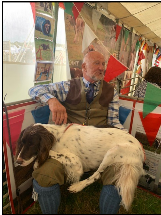
Cracker and I enjoying a cuddle

We fielded a team of GLP owners to represent the breed at the Game Fair and generated a great deal of interest (see front cover). I was fortunate enough to be invited to judge the first HPR Home International match, which also ran at the Game Fair and was great fun.