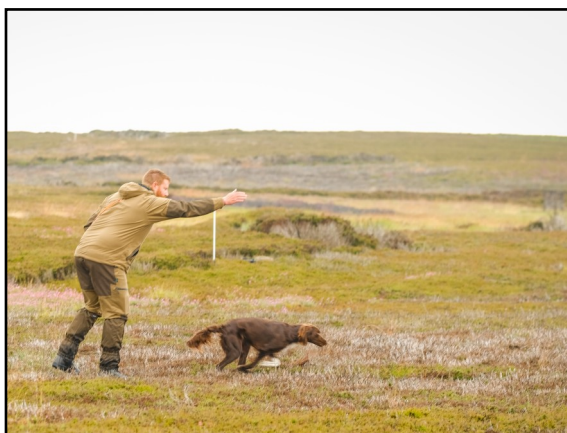
Ivy sets off