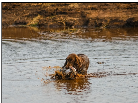
Ivy practicing water retrieves

So there it is, my first experience on grouse and we are now hooked. I write this following our second weekend on Roxby Estate, this time for an introduction to field trialling where we came away with a Certificate of Merit.