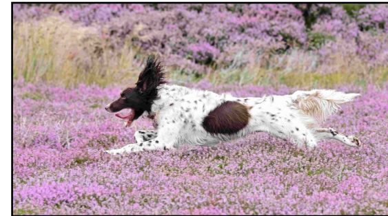
'FTCh Wamilanghaar Point Blanc of Caldera' HPR Champion 2023

So here goes; whilst serving in Her Majesty's Royal Marines I met a former Gamekeeper who had joined up and we became friends. We used to shoot over his little springer called Tess; she was very random in her work and I made a comment to that effect!