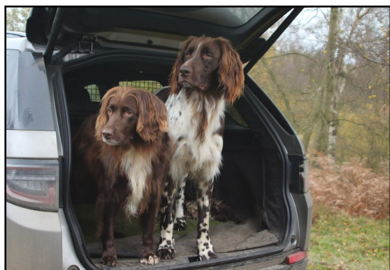
Loki and Lara, ready for action- as featured in the Skinners 2025 Calendar 9