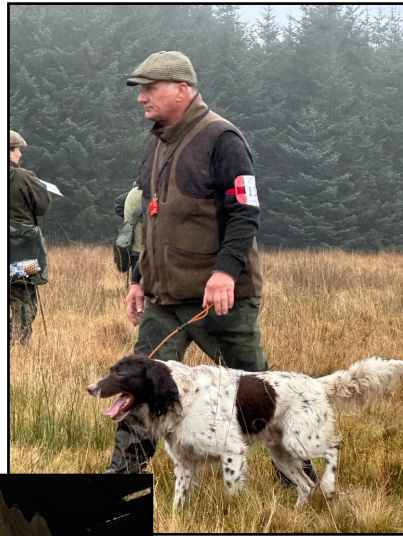
Above- FT Ch Wamilanghaar Point Blanc of Caldera S Kimberley