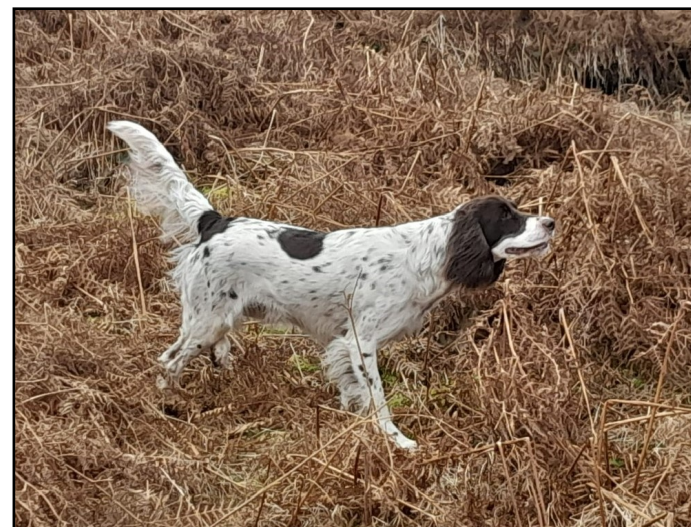
Caldera Bourbon Queen aka 'Beaty'